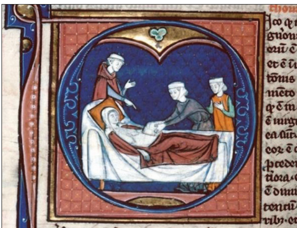
Figure 3. Cesarean section performed by a physician and two midwives. Avicenna, Canon , Paris (France), 3 rd quarter of the 13 th century. Besançon, Bibliothèque Municipale, Ms. 457, fol. 260v. http://www.enluminures.culture.fr/Wave/savimage/enlumine/irht5/IRHT_084672-p.jpg [Capture 28/7/2024]

We cannot establish with certainty the exact date when the first caesarean section was performed on a live woman. From the 16 th century onwards, there have been records of the first caesarean sections performed successfully on a live woman in terms of maternal survival.